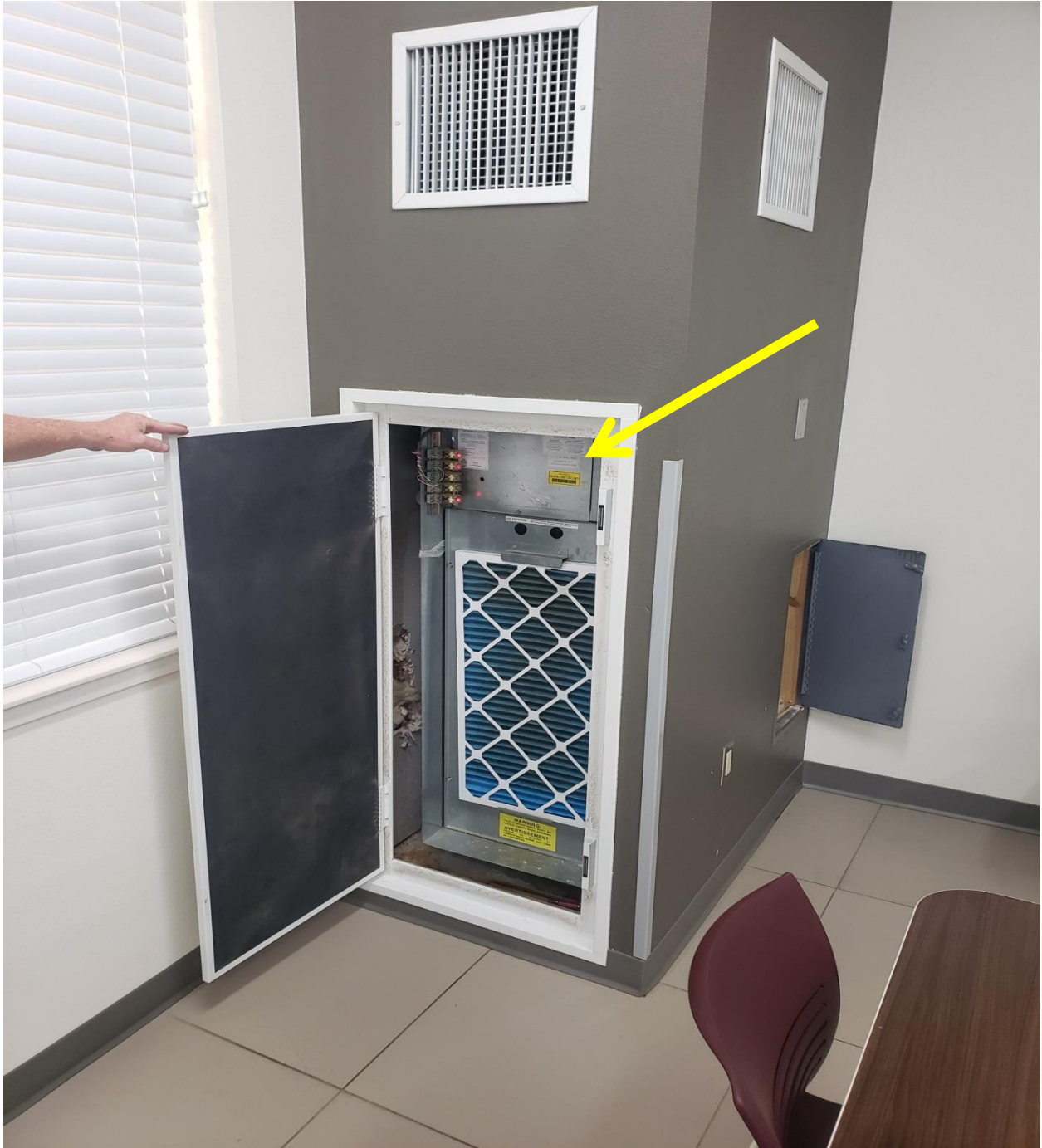
TYPICAL CONTROLS, COIL, AND FILTER ACCESS. DOORS TO BE REPLACED. CONTRACTOR TO PROVIDE AND INSTALL NEW FILTERS.