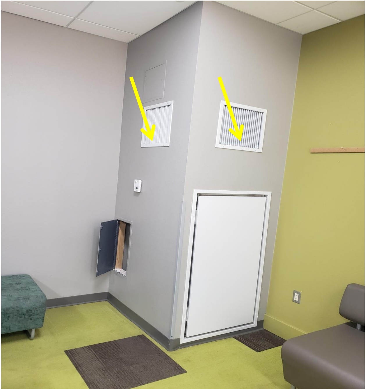
TYPICAL SUPPLY GRILLS. CONTRACTOR TO PROVIDE AND INSTALL NEW GRILLS PER MANUFACTURES SPECIFICATIONS.