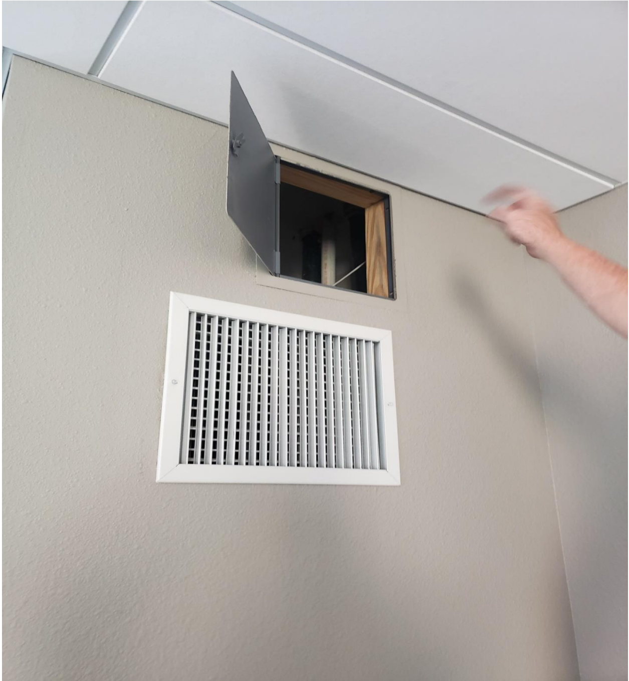
OPEN FRESH AIR DAMPER ACCES DOOR.