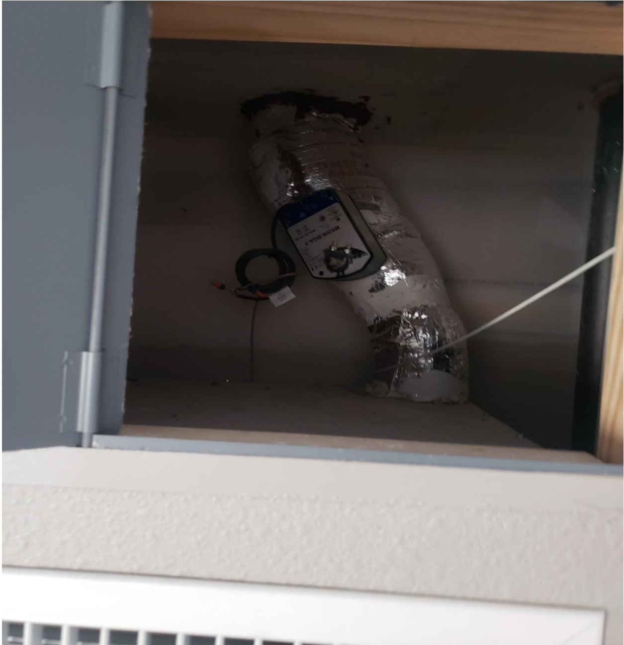
INTERIOR VIEW OF FRESHAIR MOTOR