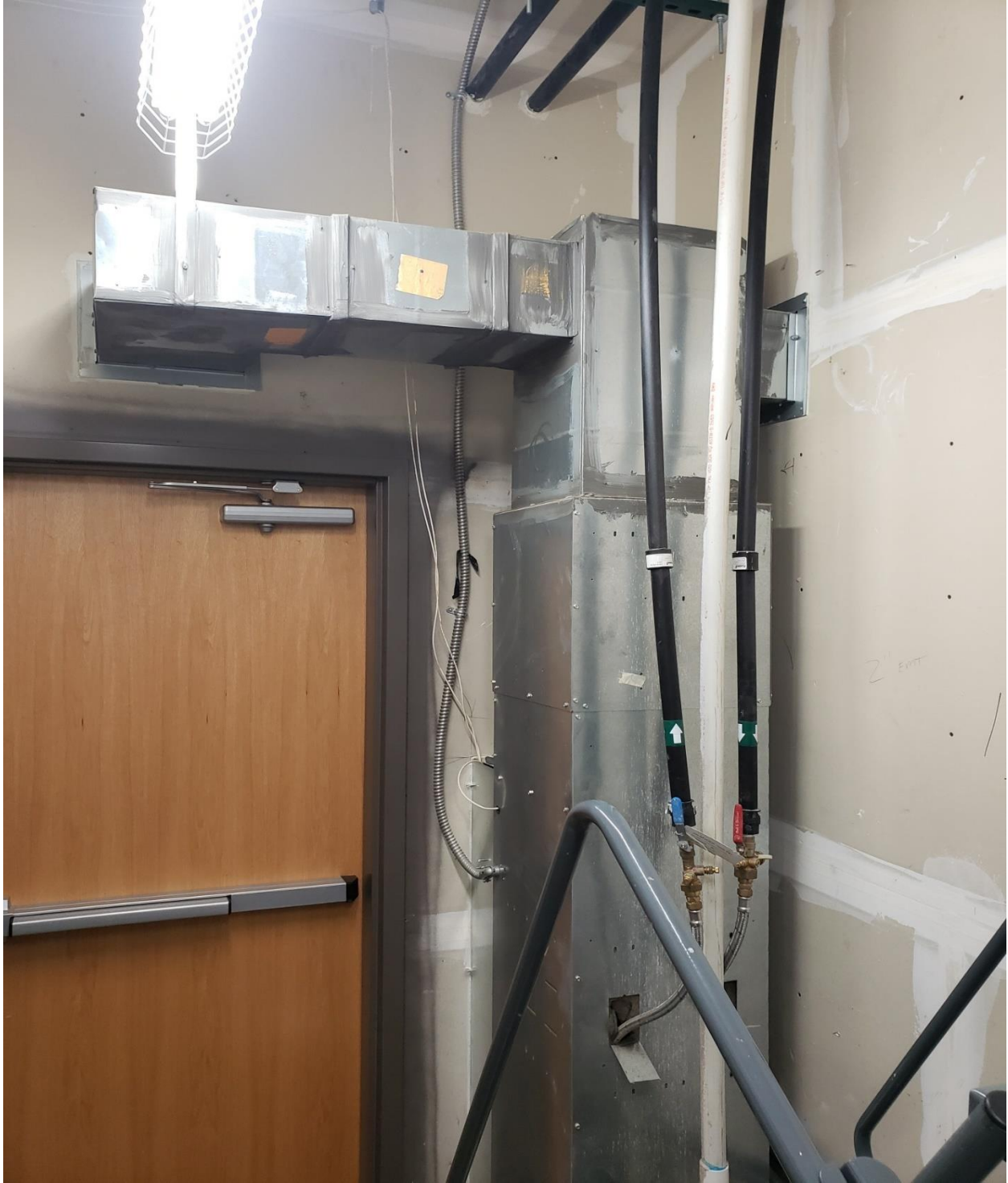
EXISTING 1 TON UNIT INSIDE THE MECHANIOCAL CLOSET.