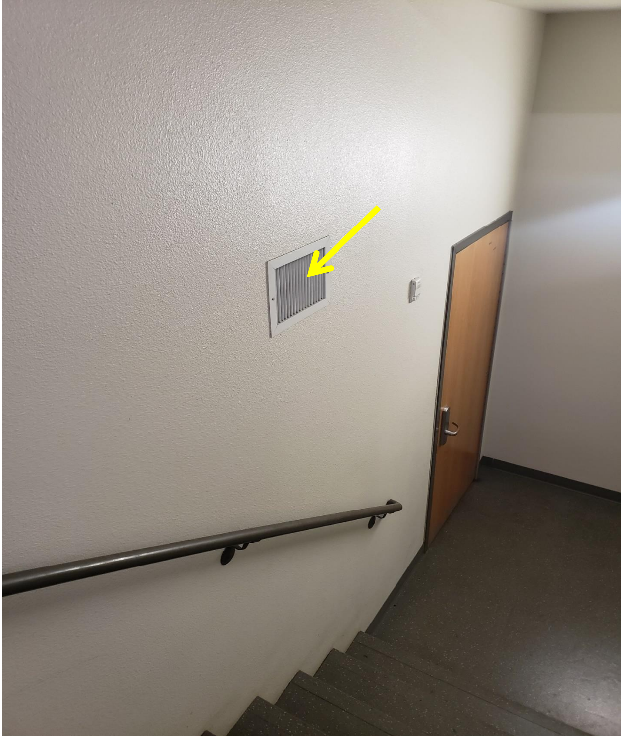
SECOND SUPPLY GRILL FROM ELEVATOR LOBBY UNIT. THIS IS TYPICAL PLACEMENT OF SUPPLY DUCT & GRILL ON ALL THREE FLOORS.