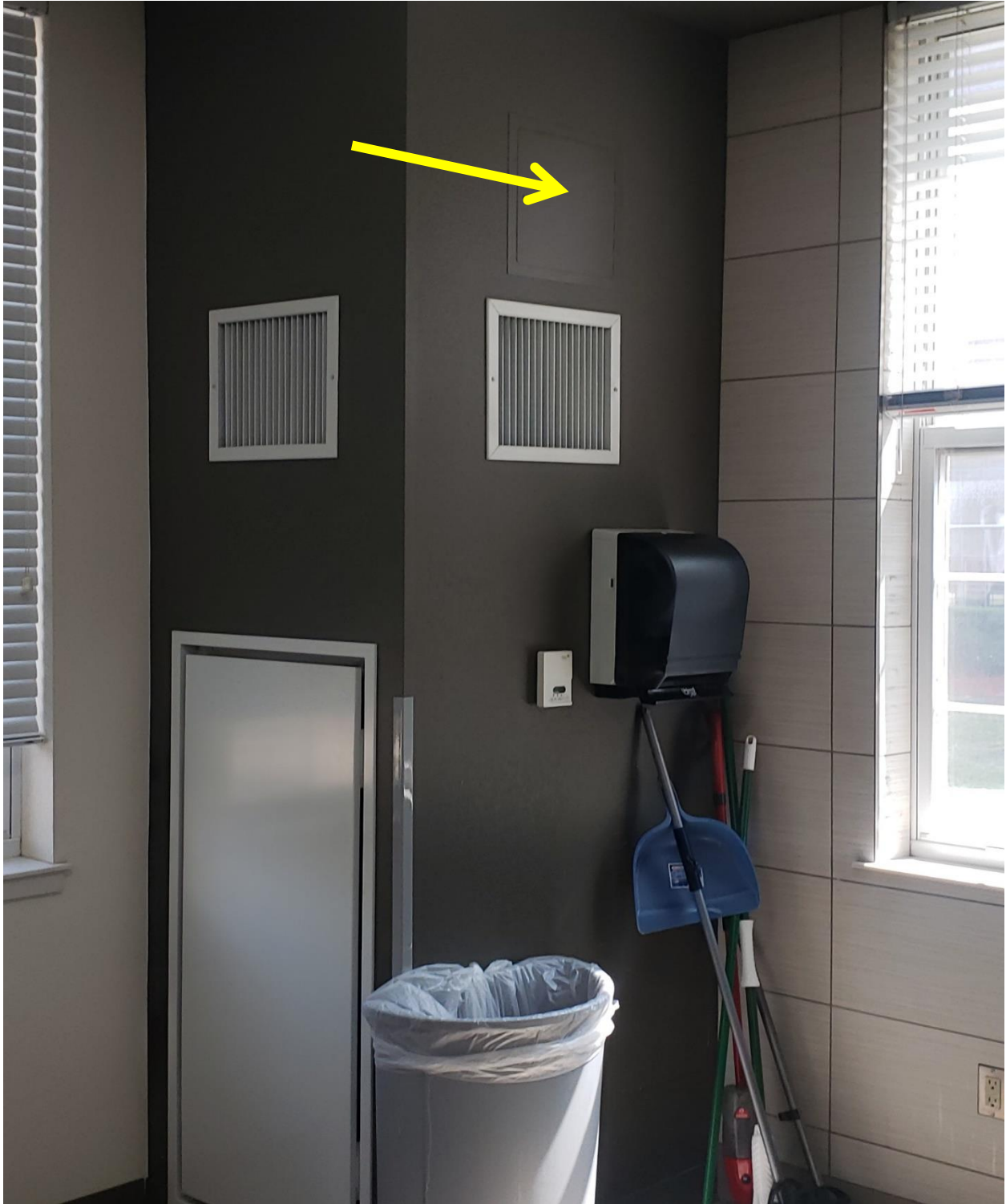
TYPICAL ACCESS TO THE FRESH AIR DAMPER MOTOR. ACCESSPANEL TO BE REUSED.