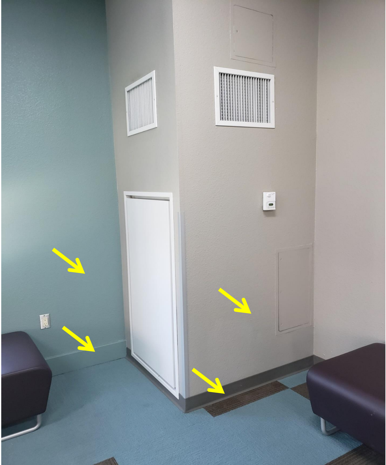
WALL AND COVE BASE TO MATCH EXISTING COLORS THROUGHOUT THE BUILDING