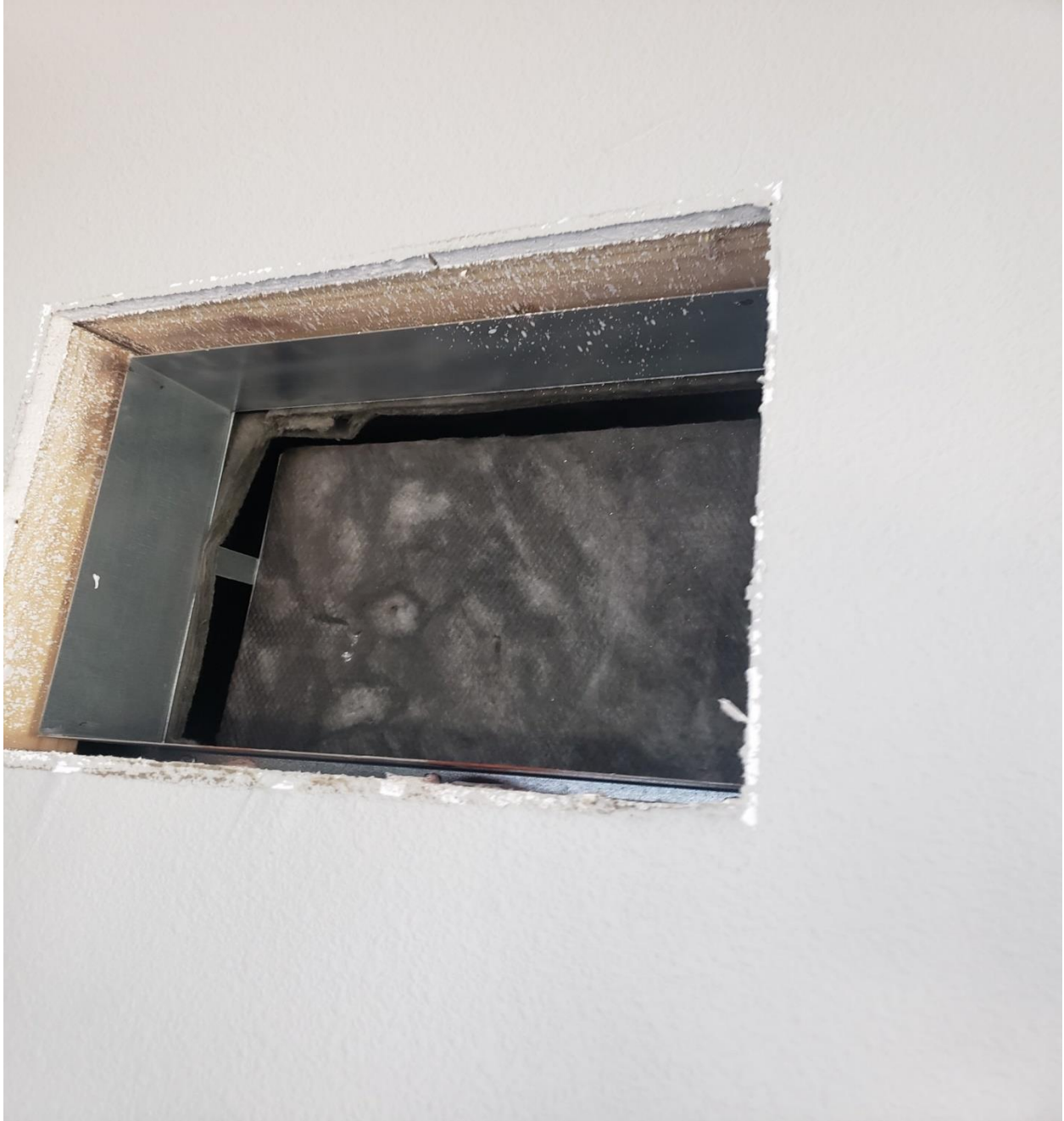
INTERIOR VIEW BEHIND THE SUPPLY DUCT.