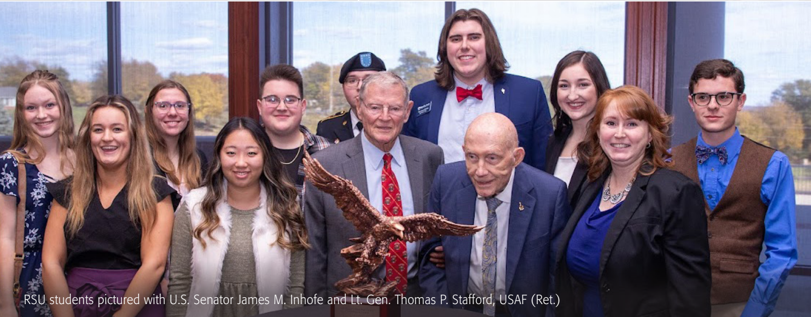
RSU students pictured with U.S. Senator James M. Inhofe and Lt. Gen. Thomas P. Stafford, USAF (Ret.)

determined by the states. It must be the states. Senator Inhofe knows the Constitution. He knew it must be the states even when other members of our delegation did not. His unwavering commitment to the Constitution is what has made him a great public servant and U.S. Senator."