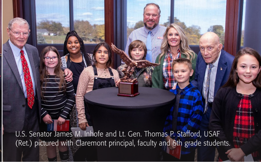
U.S. Senator James M. Inhofe and Lt. Gen. Thomas P. Stafford, USAF (Ret.) pictured with Claremont principal, faculty and 6th grade students.