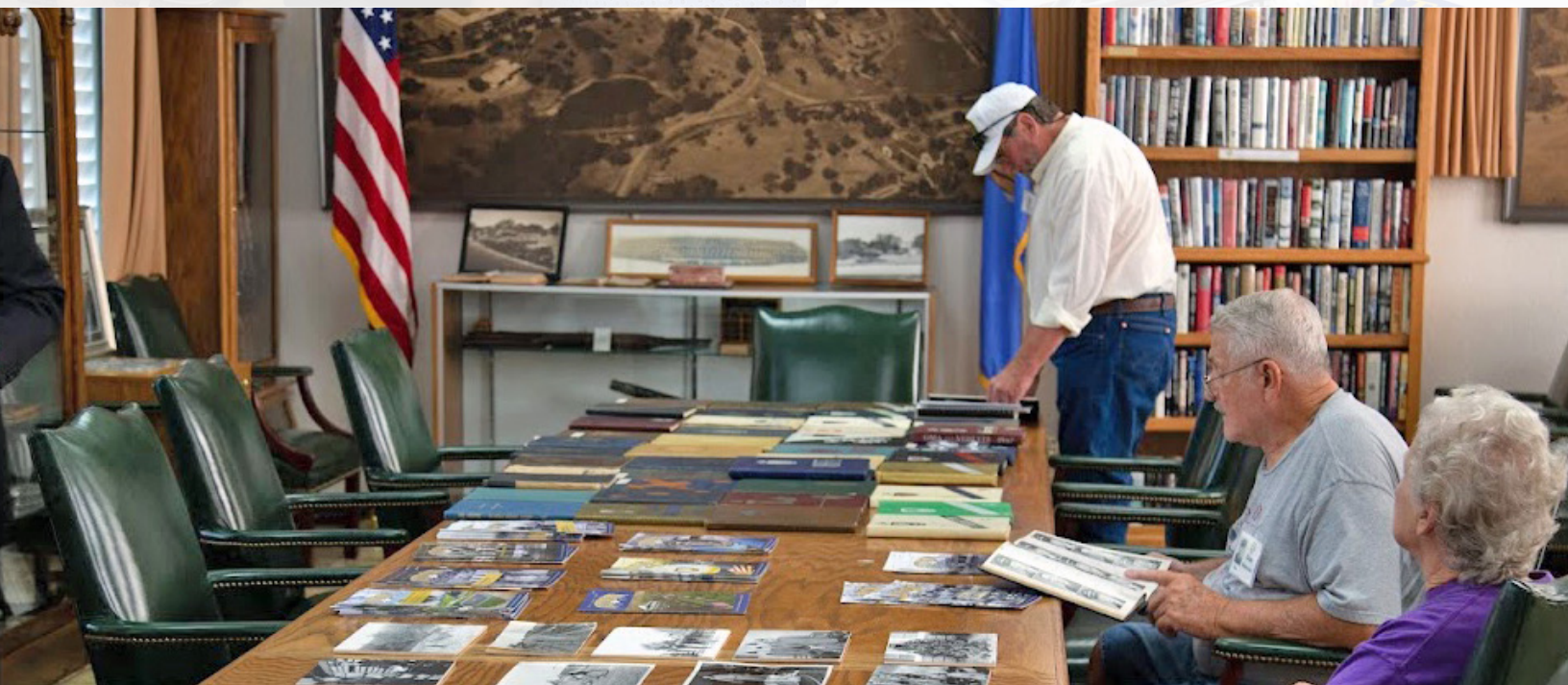
OMA Alumni and guests enjoying OMA memorabilia in the OMA Museum during the reunion.