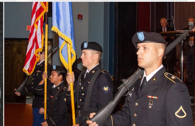
RSU GOLD Program students "Post the Colors" at the Distinguished Alumni/Hall of Fame Ceremony