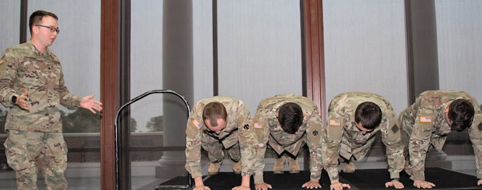
RSU GOLD Program students perform in Kadet Kapers Friday night of the 2021 OMA Alumni Reunion.