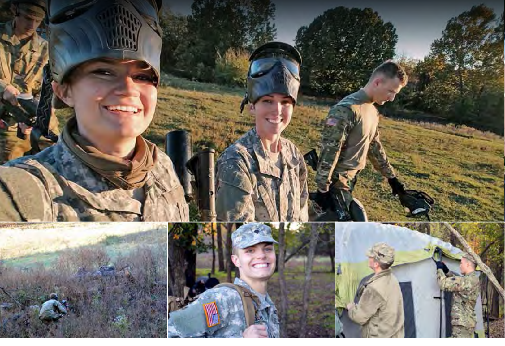
RSU GOLD Office Candidates (OC's) conducted a Field Training Exercise on Saturday, November 12, 2016 in order to practice squad tactical exercises.