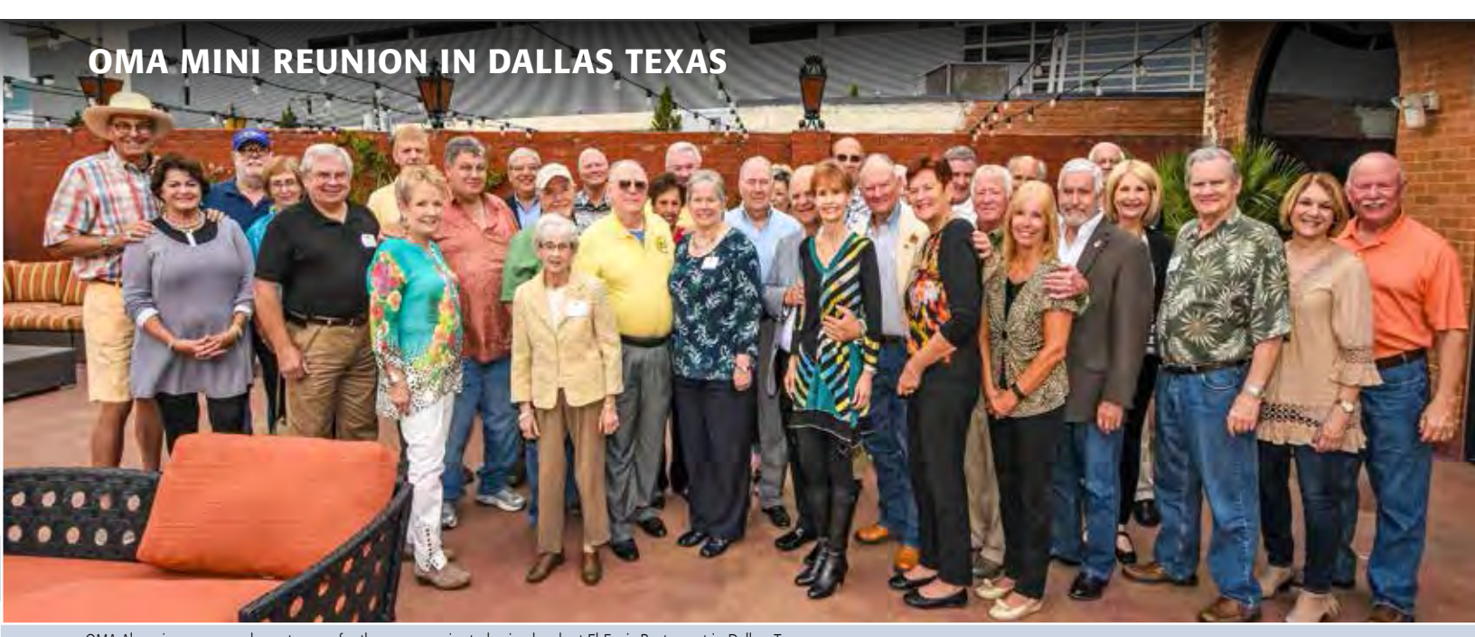
OMA Alumni, spouses and guests pose for the camera prior to having lunch at El Fenix Restaurant in Dallas, Texas.