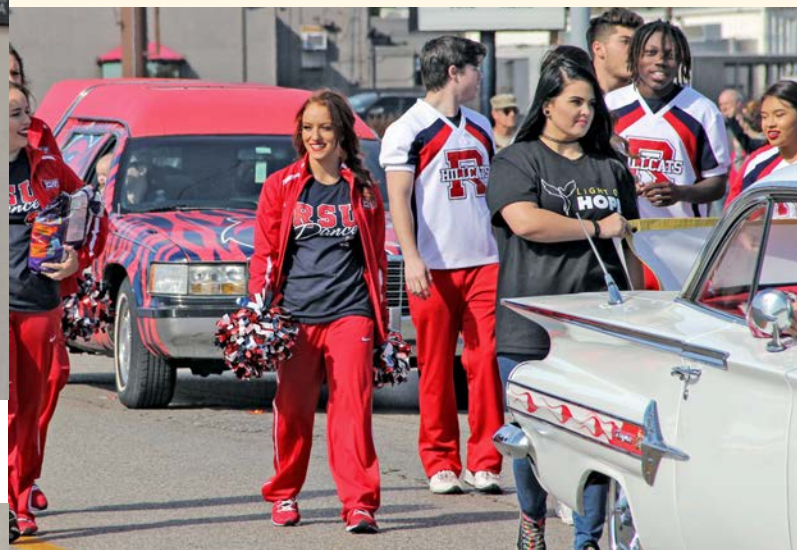
The RSU Spirit Car is seen here in the Claremore Veteran's Day parade along with RSU students, including members of the RSU cheerleading and dance squads.