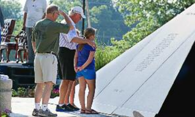
OMA alumni and family members pay tribute to the OMA Killed In Action Memorial.