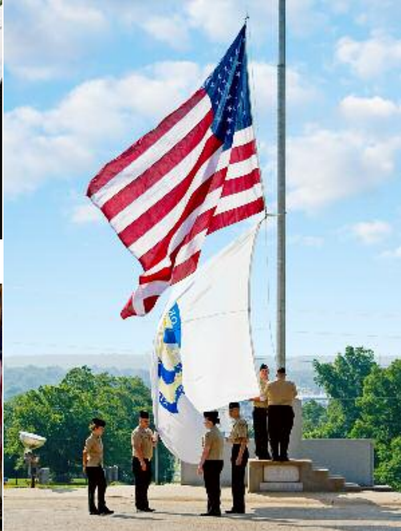
Claremore High School Navy Junior ROTC Cadets prepare to raise flags at the Morning Formation.