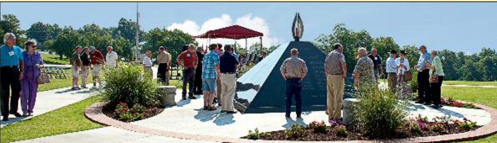
The OMA KIA Memorial has 101 names of OMA Alumni who were killed in action in World War II, the Korea War and the Vietnam War

COURAGE LOYALTY HONOR • YESTERDAY TODAY TOMORROW