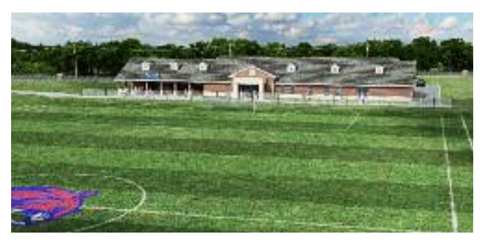
The Soldier Field renovation includes artificial turf, locker rooms and training facilities for soccer and cross country, as well as, concession stand and public restrooms

The first of the two new projects to be completed will be an 8,000-square-foot baseball/softball facility to include concessions, restrooms and new grandstands. The first floor includes concessions and restrooms for patrons as well as two dressing rooms for umpires and multiple storage areas. The second floor features separate press boxes for baseball and softball, coaches' offices and a donors' suite with indoor and outdoor seating. New grandstands with stadium seating, a ticket booth and a paved entry plaza. Construction is ongoing, even with home games returning to the baseball/softball complex earlier this month. Final construction is expected to be completed in April.