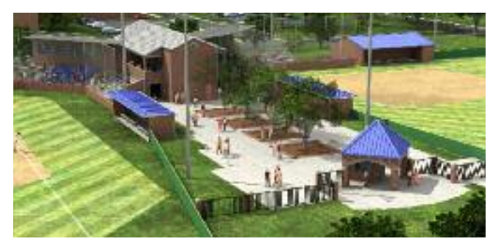
The new baseball/softball facility will include concessions, restrooms, grandstands and a ticket booth with a paved entry plaza.