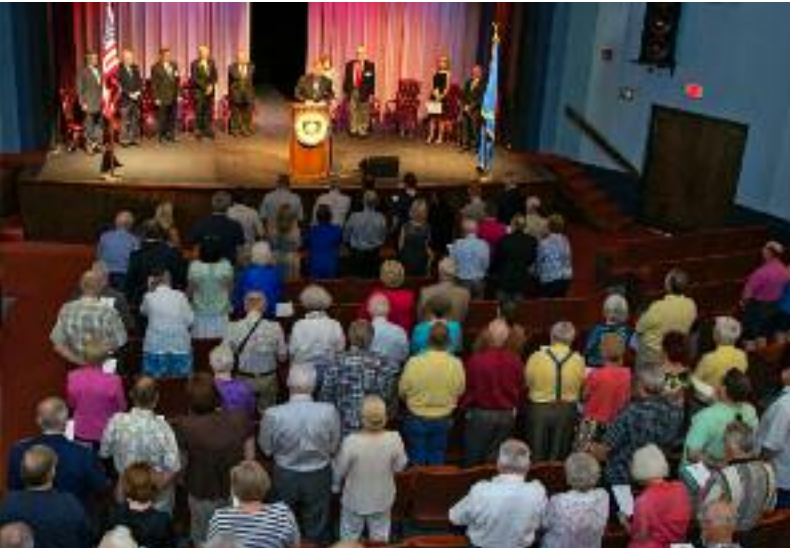
Distinguished Alumni and Hall of Fame Award Ceremony at the 2014 OMA Alumni Reunion