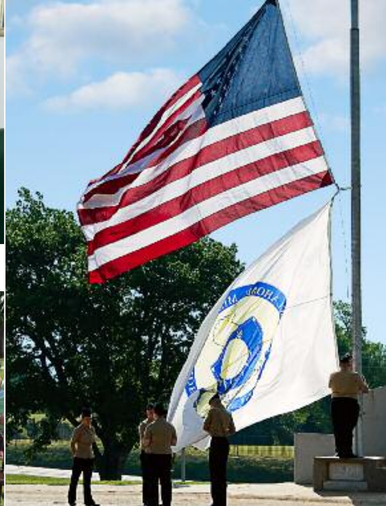
Claremore High School JROTC unit helps start off the Morning Formation by raising the OMA and United States flags.