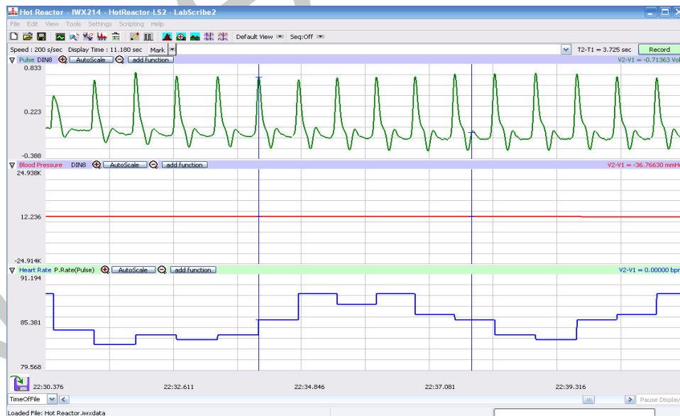
Figure HP-6-L1: Pulse and heart rate data from a relaxing subject.