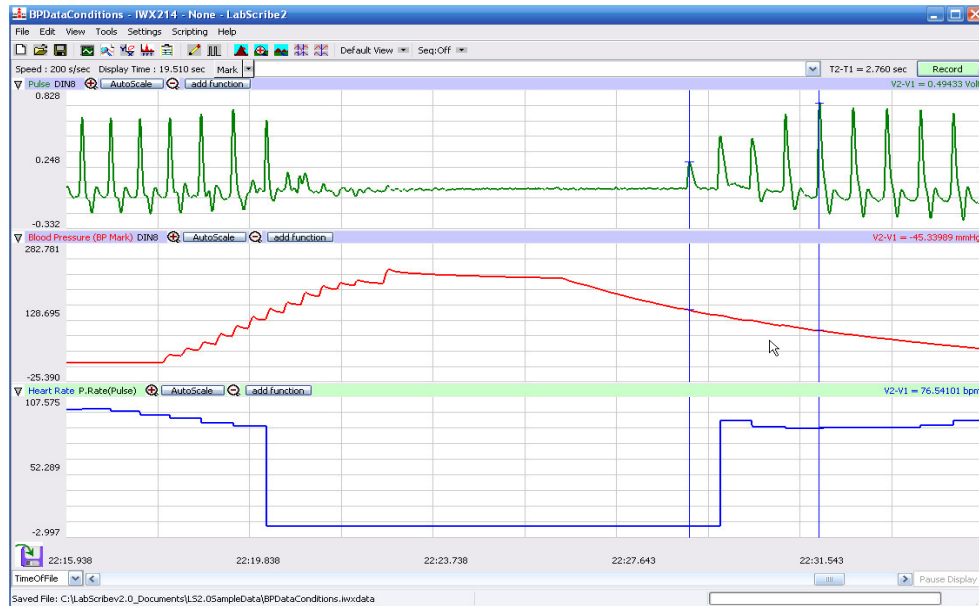
Figure HP-6-L2: The pulse waves and the pressure in the BP-600 recorded during the occlusion of the brachial artery as displayed in the Main window. Pulses disappear when the pressure in the cuff exceeds the pressure in the artery. The pulse wave reappears when the pressure in the cuff is released, The subject's heart rate is recorded on the bottom channel.