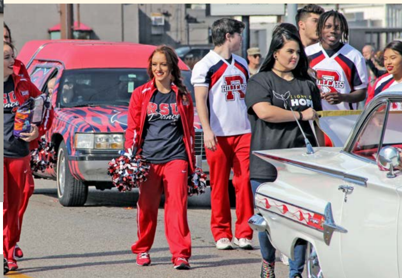
The RSU Spirit Car is seen here in the Claremore Veteran's Day parade along with RSU students, including members of the RSU cheerleading and dance squads.