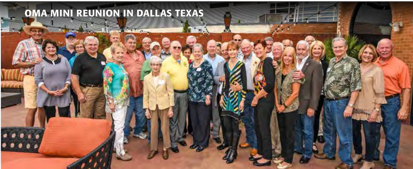
OMA Alumni, spouses and guests pose for the camera prior to having lunch at El Fenix Restaurant in Dallas, Texas.