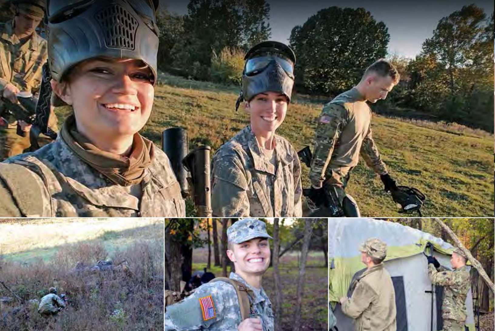
RSU GOLD Office Candidates (OC's) conducted a Field Training Exercise on Saturday, November 12, 2016 in order to practice squad tactical exercises.