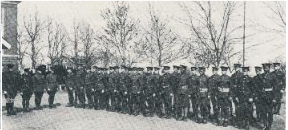
120th Ordnance Maintenance Co. ONG. Federal Inspection, March 30, 1925.