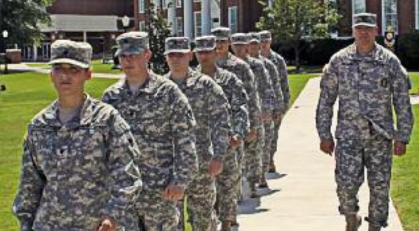
The GOLD Program inaugural class marches in front of Meyer Hall on the RSU campus.