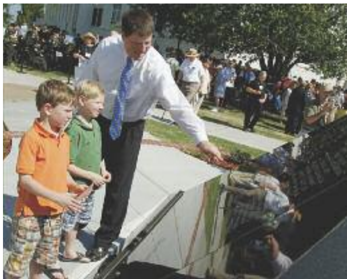
The 2011 OMA Reunion saw the dedication of the OMA KIA Memorial where family members and friends came to pay tribute to the fallen soldiers.

COURAGE LOYALTY HONOR • YESTERDAY TODAY TOMORROW