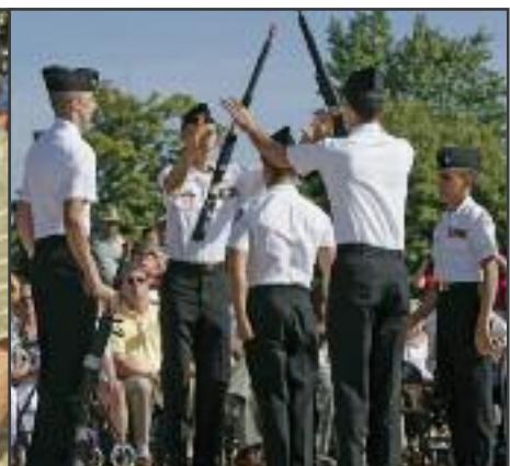
A highlight of this year's ceremony was a drill presentation by Claremore High School Navy Junior ROTC cadets.