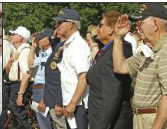
Salute! Morning Formation flag salute.