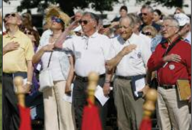
The raising of the flags at Morning Formation.