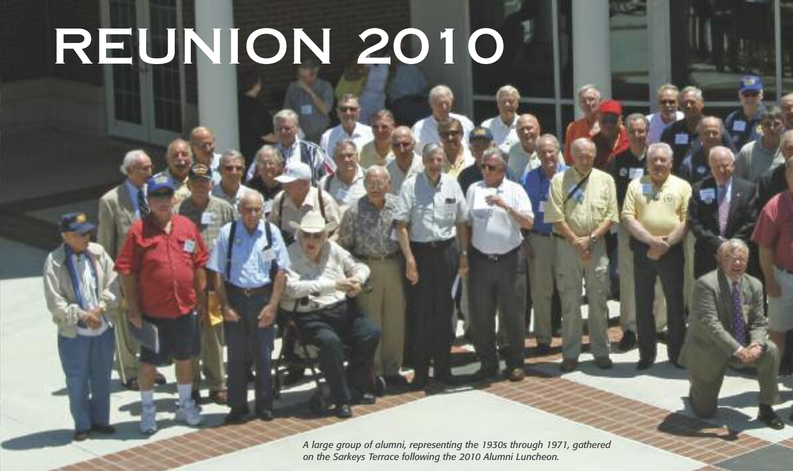
A large group of alumni, representing the 1930s through 1971, gathered on the Sarkeys Terrace following the 2010 Alumni Luncheon.