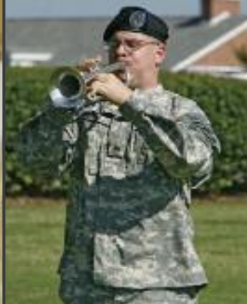
A member of the 395th Army Band provided the poignant sound of Taps as Reunion attendees memorialized the passing of alumni members within the last year.