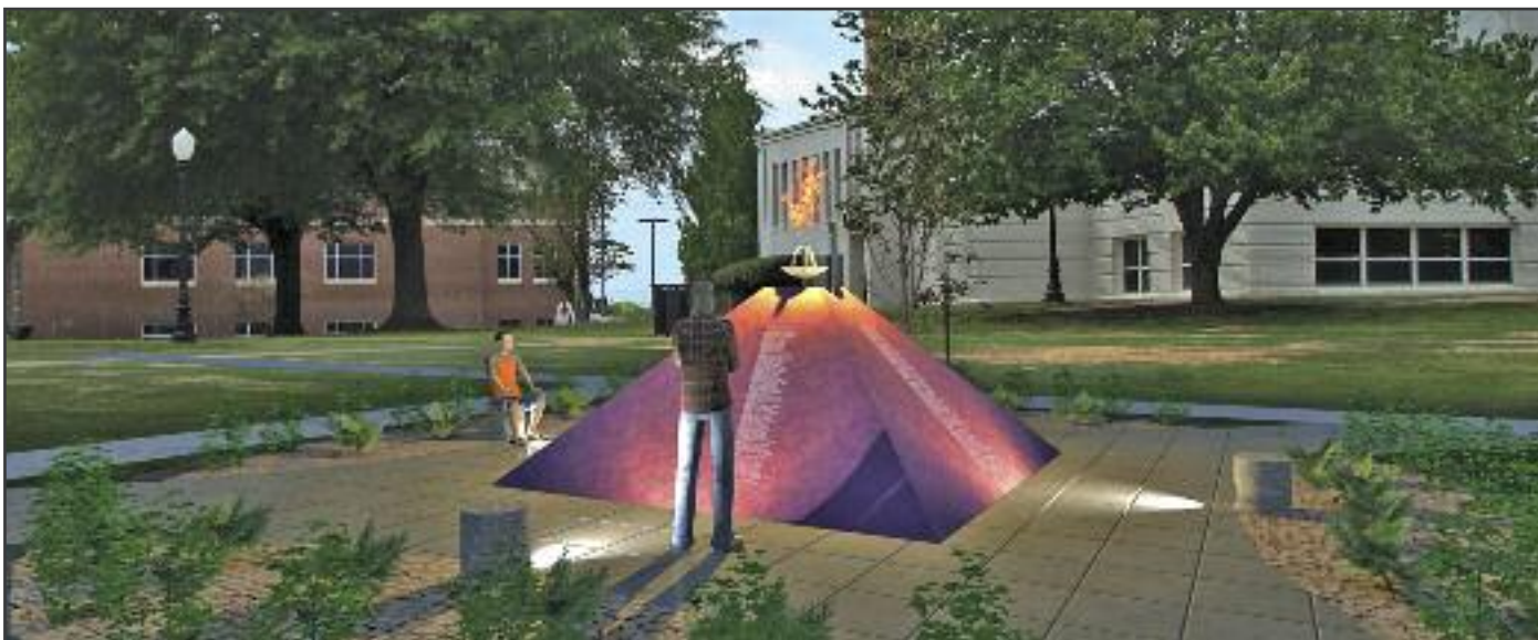
This architectural rendering depicts the Oklahoma Military Academy Killed In Action Memorial, to be located between Meyer and Preparatory Halls.