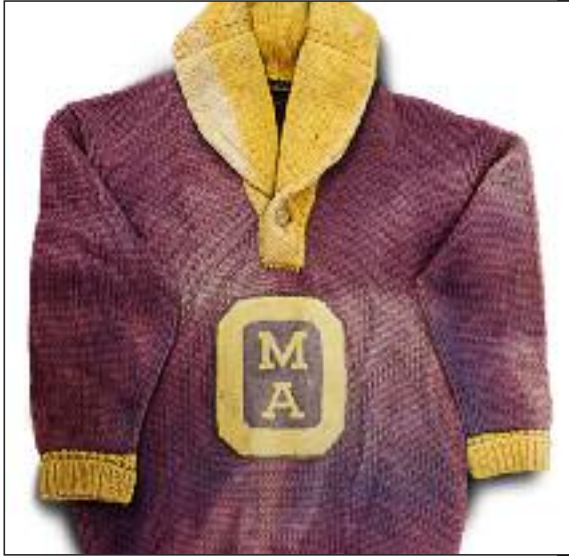
Framed Letter Sweater.