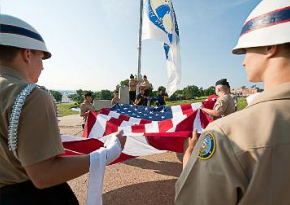
The 2013 OMA Alumni Reunion theme is "Honoring All OMA Alumni Who Served and Protected their County in Times of War and Peace."